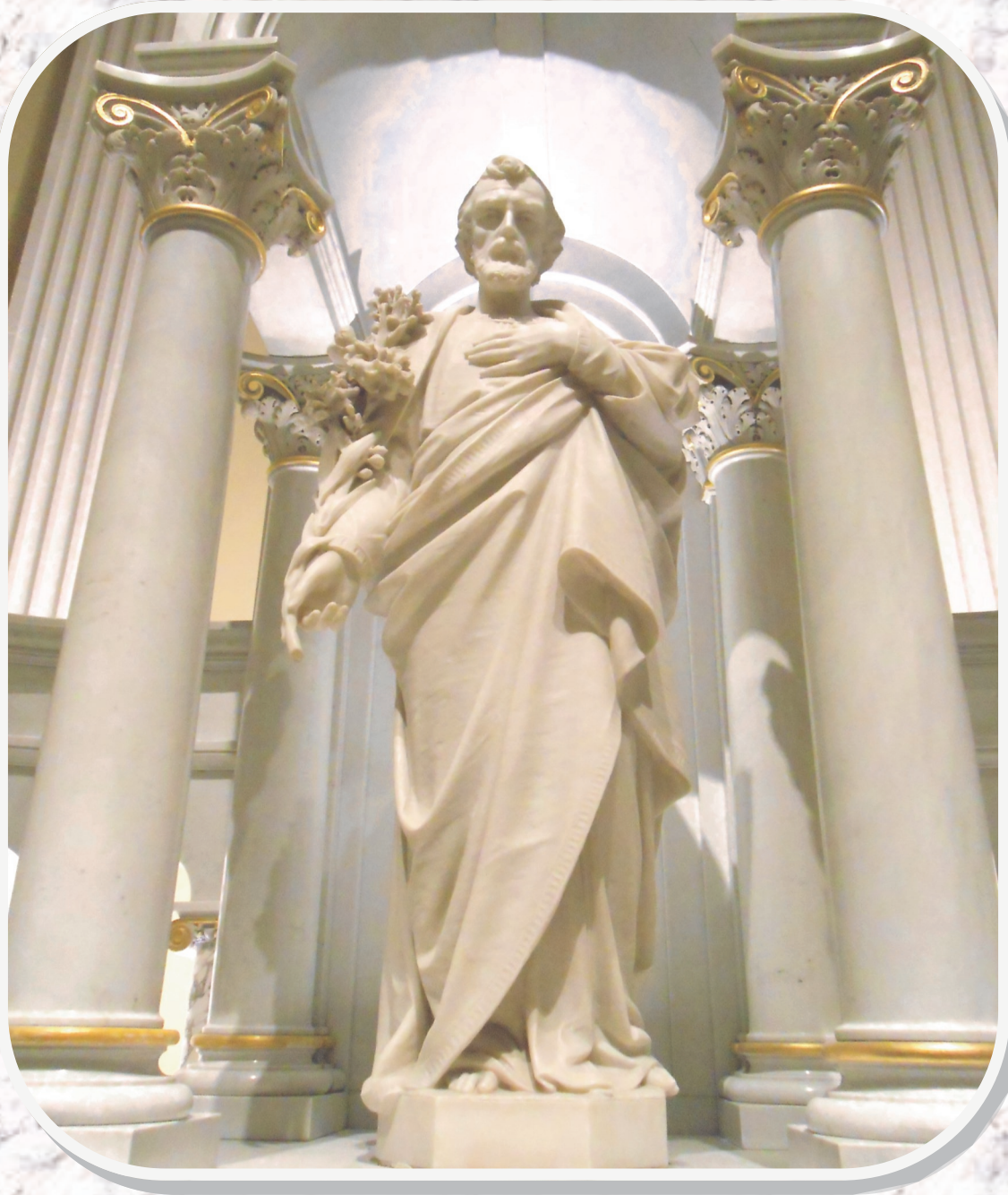
Statue of St. Joseph St. Patrick Church

Saint Patrick Parish Saint Hedwig Parish